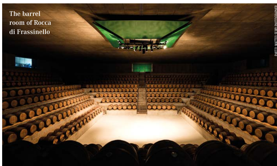
The barrel room of Rocca di Frassinello