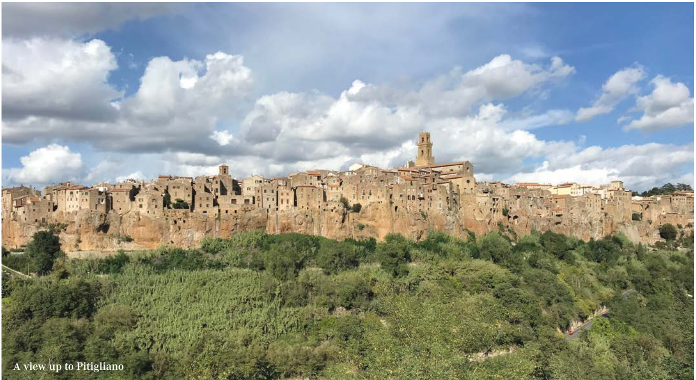
A view up to Pitigliano

Bianco Pitigliano, one of the first Italian DOCs.