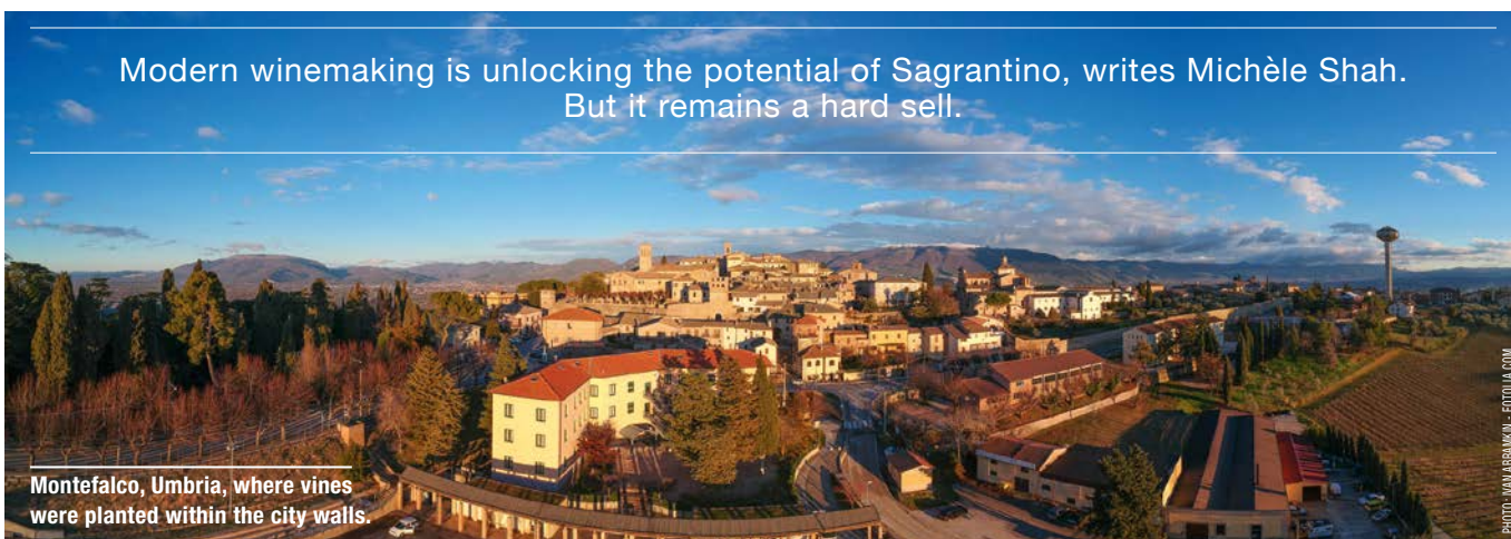
Montefalco, Umbria, where vines were planted within the city walls.

Modern winemaking is unlocking the potential of Sagrantino, writes Michèle Shah. But it remains a hard sell.